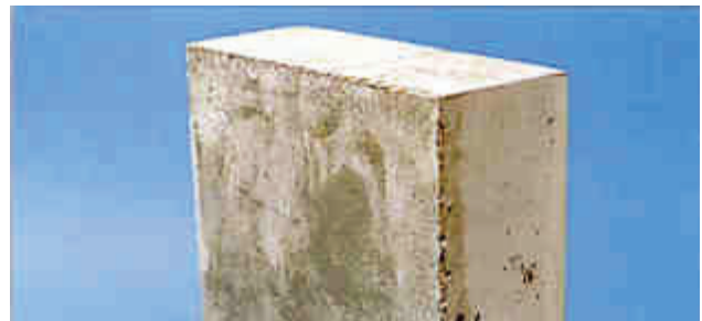
2 hours after application