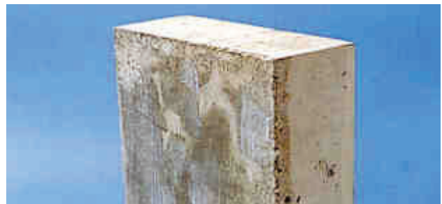
30 minutes after application