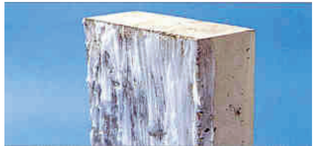
Nitocote SN508 Creme freshly applied

During or on completion of the works the client will mark areas to be tested for depth of penetration by testing at a minimum rate of one core per 300 m 2 of treated concrete.