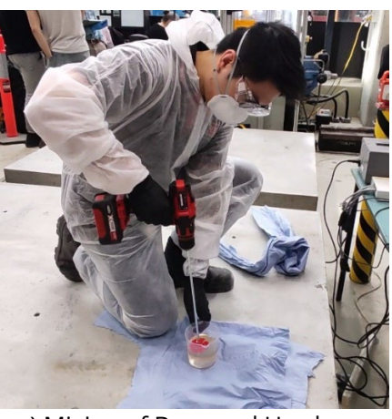
e) Mixing of Base and Hardener