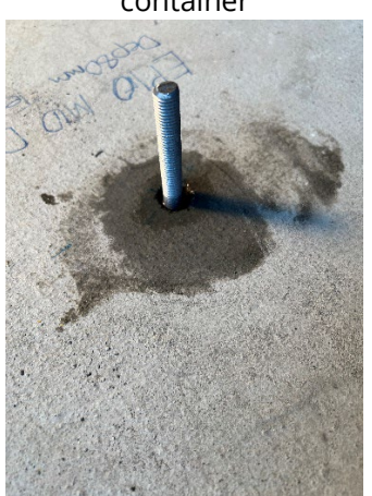
f) Anchor installed in concrete