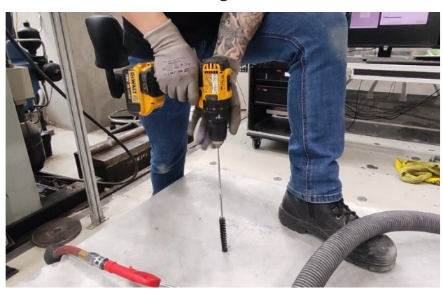
c) Brushing of hole