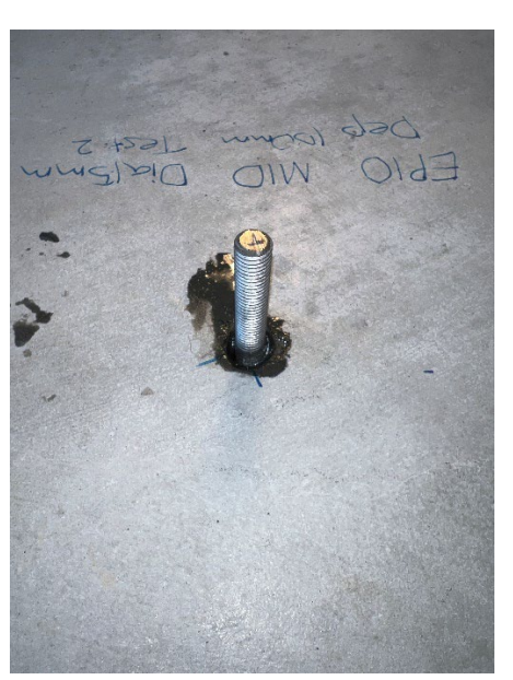
b) Anchor installed with ConbextraEP10 epoxy