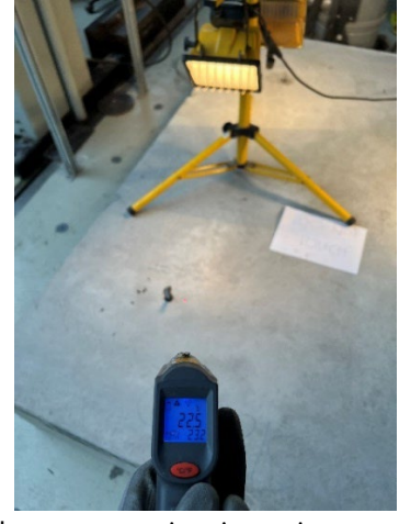
g) Heat lamps to maintain curing temperature Figure 2 Installation of anchor in concrete

The test arrangement consists of a hand jack, a self-reacting frame, load cell and a fixture to connect the anchor as shown in Figure 3. The load on the anchors were continuously monitored and recorded.