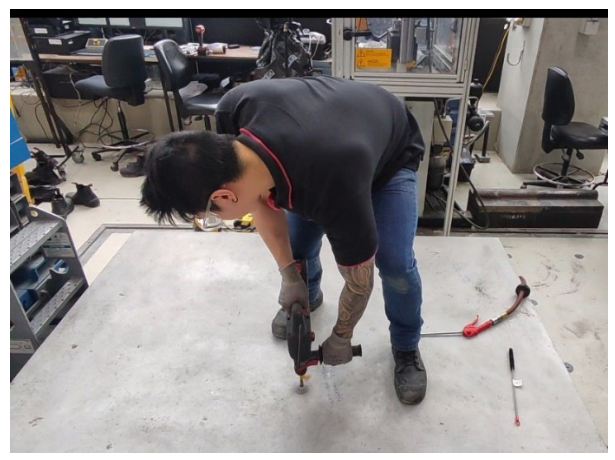
a) Drilling of hole

followed by brushing and then again followed by blowing with compressed air. The components of epoxy i.e., the base and hardener were mixed using a spiral mixture for three minutes before application. The mixture was then filled into the holes to about 2/3^{rd} of the hole depth. The anchor rod was gently rotated vertically down into the hole with a slow turning action. The excess epoxy exuding out of the hole was cleaned. Heat lamps were set near the anchors to maintain a curing temperature of approximately 23 °C. The installation process is shown in Figure 2.