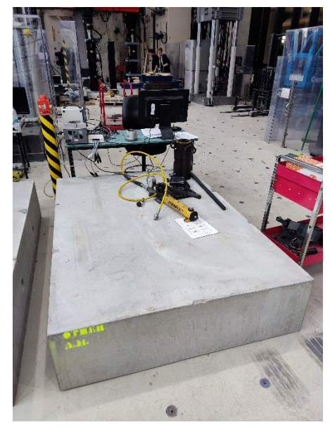
a) Slab before installation of anchor

The work was undertaken at the Swinburne University of Technology (SUT) in Hawthorn, Victoria.