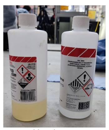
d) Base and hardener in separate container