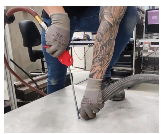
b) Blowing of dust particles