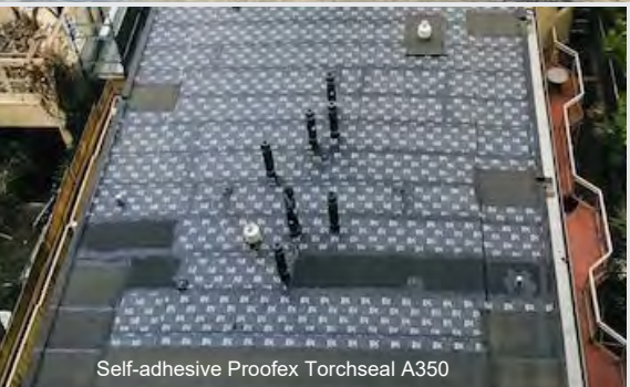
Self-adhesive Proofex Torchseal A350