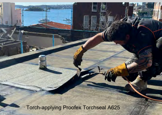
Torch-applying Proofex Torchseal A625