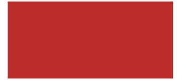
R13 SIGNAL RED MTO