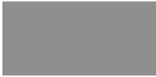
N43 PIPELINE GREY