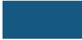
B23 BRIGHT BLUE MTO

Available as a clear and eight colours, including six Australian Standard colours.