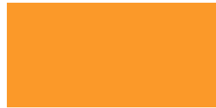
Y15 SUNFLOWER MTO