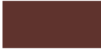
R63 RED OXIDE