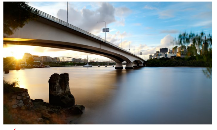
V Bridge structures