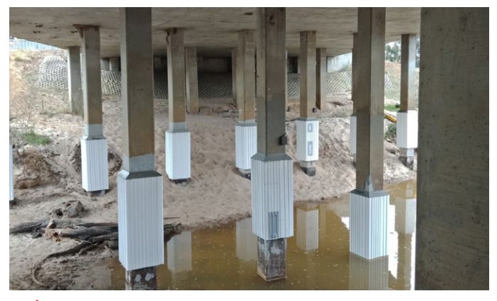
✓ Bridge piles