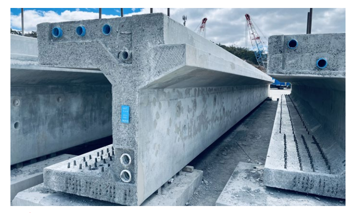
✓ Pre-cast concrete