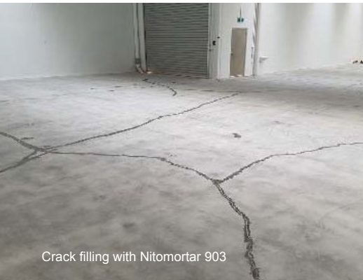
Crack filling with Nitomortar 903