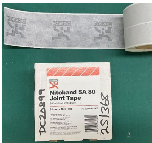
Figure 1: As received test materials.

The method of sample preparation and sampling was unknown.