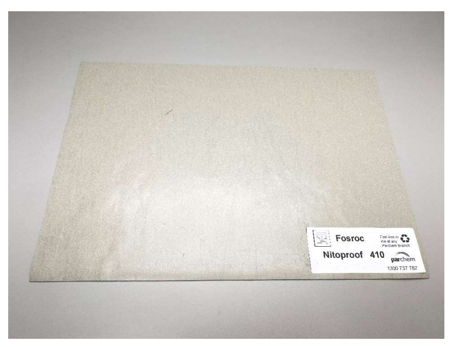
FIGURE 2 UNDERSIDE OF NITOPROOF 410