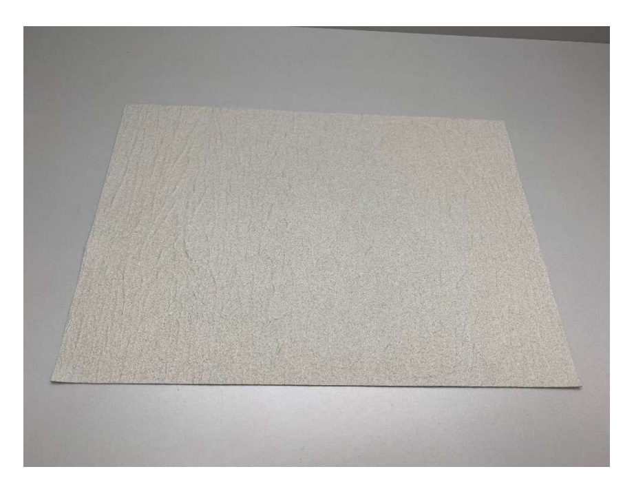
FIGURE 1 TOP FACE OF NITOPROOF 410

The supplied specimen for assessment is shown below in Figures 1 and 2.