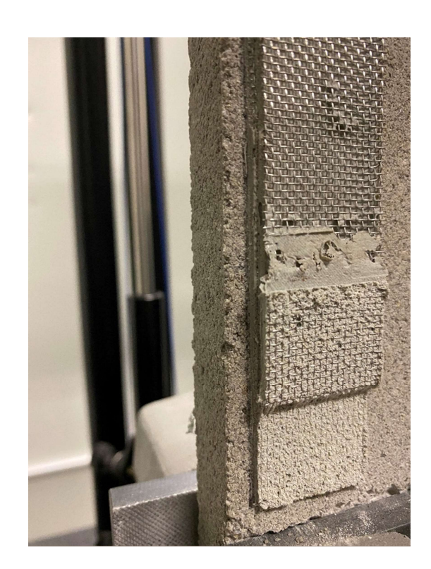
FIGURE 4 IMAGES OF TEST SAMPLE PERFORMING ADHESION-IN-PEEL