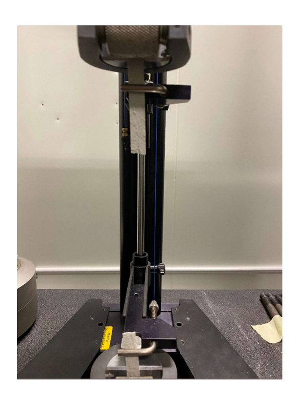
FIGURE 3 IMAGES OF TEST SAMPLE PERFORMING DURABILITY LOAD / ELONGATION TEST