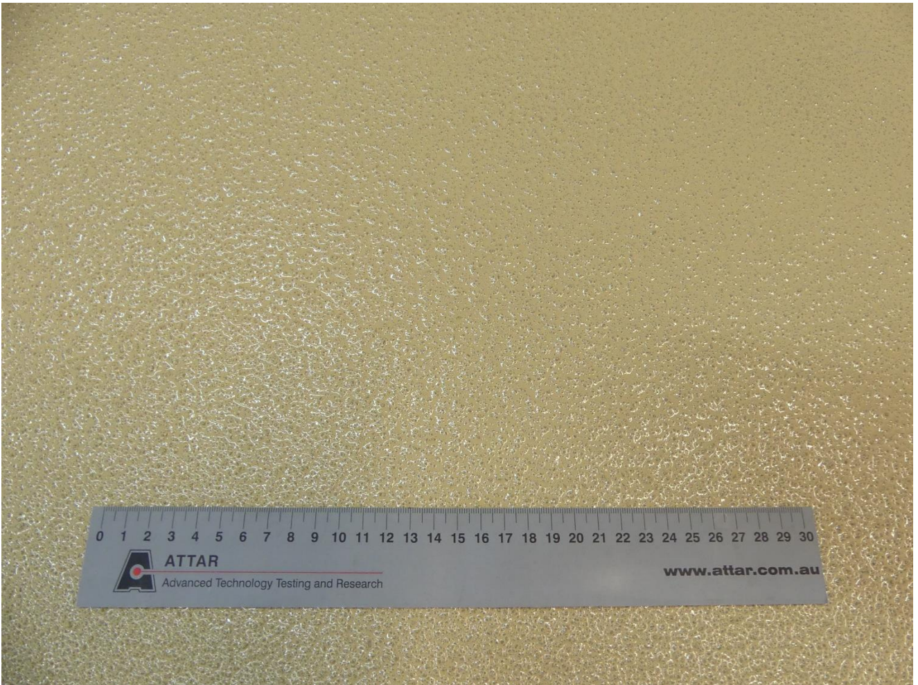
Figure 1: Fosroc Nitoflor FC150 HP + Fosroc Nitoflor Anti-Slip Grains 01 Silica Sand 16/30# + Fosroc Nitoflor PA.